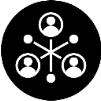
Board, Local Outreach Committees (LOCs) and Stakeholders