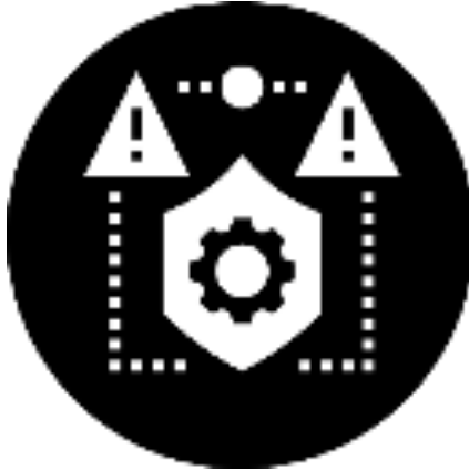
Prevention of Potential and Proven Occupational Health Hazards